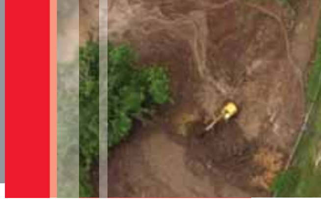
Petroecuador remediating a pit and spill area at Cononaco 6 in 2006.

According to Ecuador's Energy Minister Miguel Muñoz, Director of National Environmental Protection Management, Ministry of Energy, in an appearance before Congress on May 10, 2006: